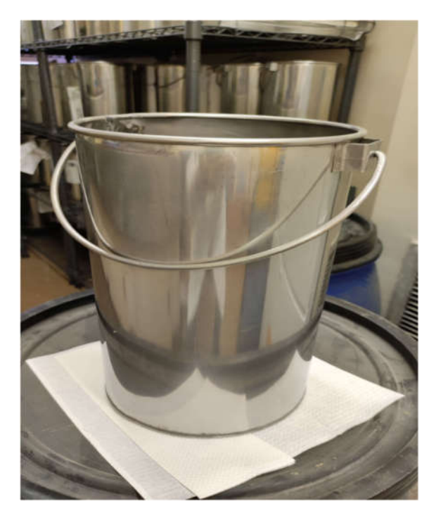
Stainless Steel Container Height 30cm Diameter 22cm Unit Price: HK$300/pc