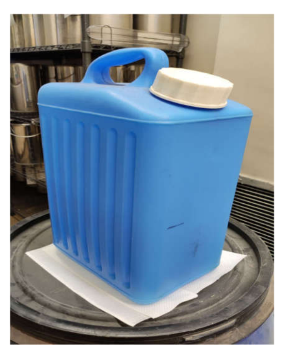
Plastic Container Height 40cm Width 22cm Length 17cm Unit Price: HK$27.50/pc