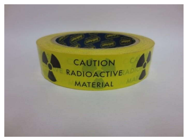
(E) Warning Tape - size 1" width Price: HK$80/roll