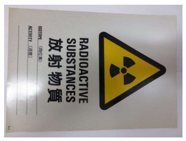
(B) Warning Sign - size 8.3" x 11.7" Unit Unit Price: HK$70/pc.