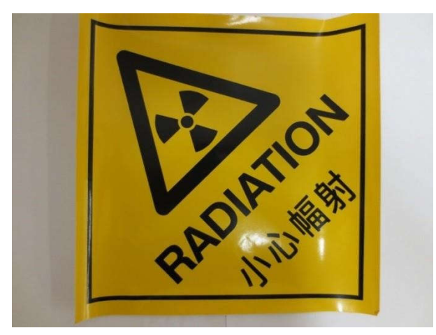
(C) Radiation Label - size 10" x 10" Price: HK$70/pc.