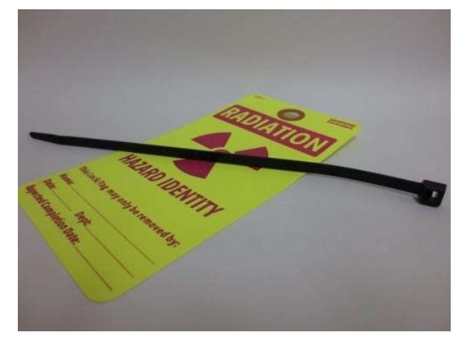
(F) Radiation Tag - size 3" x 5.7" Unit Unit Price: HK$30/pc.