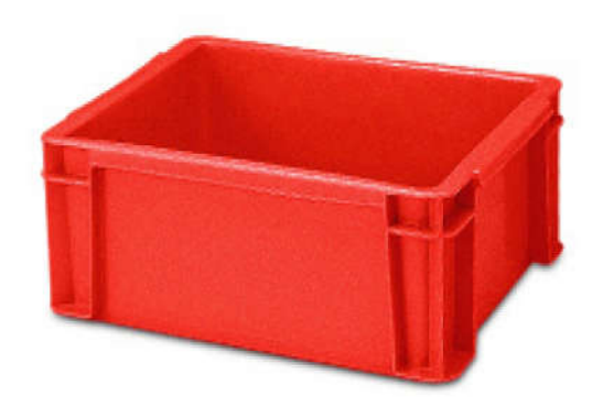
Heavy Duty Container Height 13.3cm Width 27.1cm Length 36.7cm Unit Price: HK$100/pc