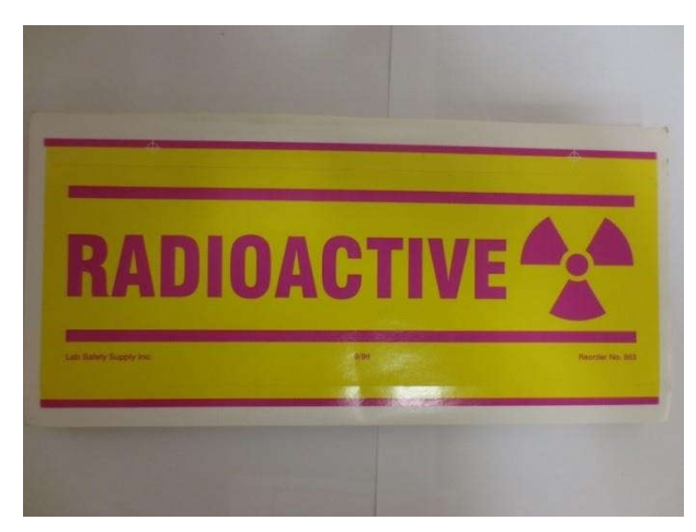
(D) Warning Label - size 3.5" x 10" Unit Unit Price: HK$35/pc.