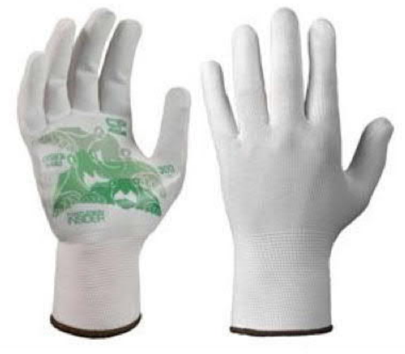
Example of a glove providing cut and puncture protection but also a level of dexterity.

For much work with sharps manual dexterity is important, so any procedures to increase safety must not make the task more difficult to perform, as new risks can be created. It is rare that the same amount of dexterity is required in both hands, and most injuries are suffered by the opposite hand to the one holding the sharp. If one handed operation cannot be achieved eg. because it is necessary to hold an animal to scruff it for injection, consider whether a cut and puncture resistant glove can be used. Kevlar gloves which give a reasonable level of dexterity can be obtained. If resistance to microbial or chemical penetration is required it may be necessary to combine use of cut and puncture resistant gloves with an inner disposable glove.